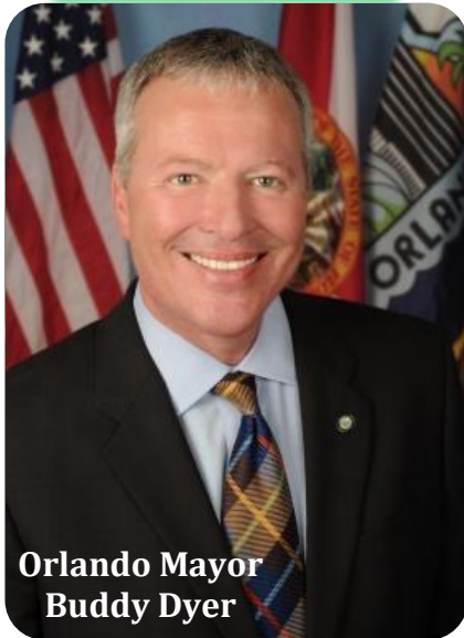
Orlando Mayor Buddy Dyer